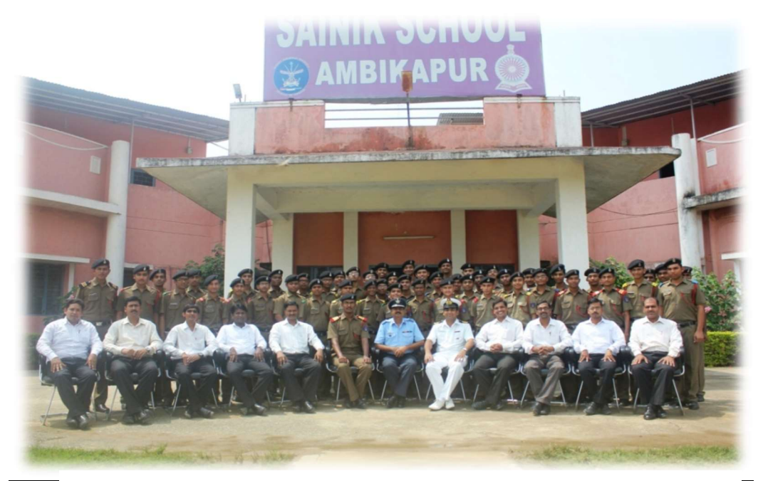
TEMPORARY CAMPUS AT NAMNAKALA