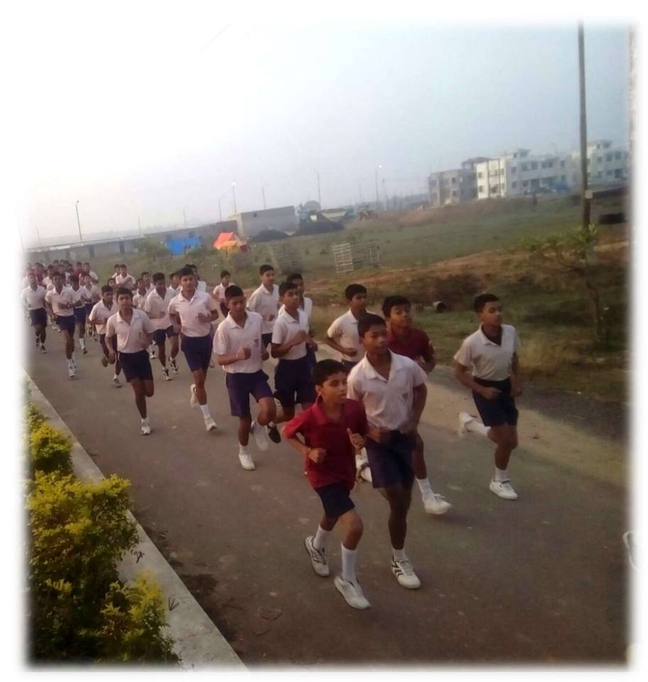
MORNING PHYSICAL TRAINING